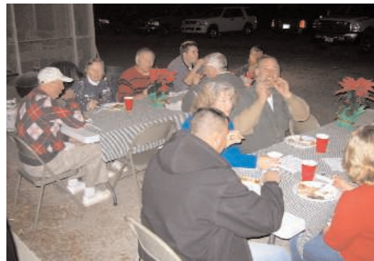
Everyone Enjoying Dinner