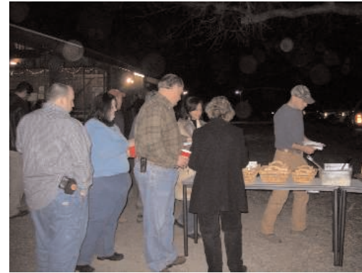
Everyone Fixing Their Plates