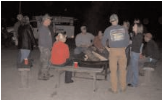
Staying Warm Around the Fire