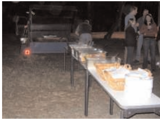
The BBQ Buffet